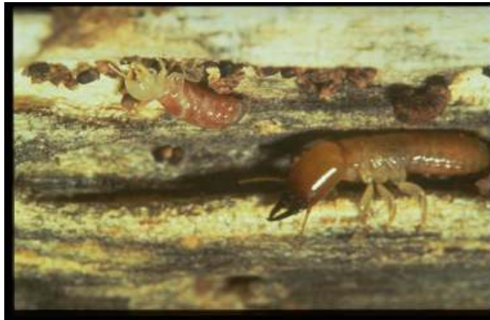
Photo of soldier and worker termites, Reticulitermes sp. (Isoptera: Rhinotermitidae).

If termites are found around structures some measures can be taken, such as applying liquid termiticides and/or installing baiting systems. Soil termiticides provide continuous chemical barrier around the structure. Termiticides should be applied in such areas as under slabs, by drilling and injecting vertically through the slab, or treating horizontally through the foundation from the exterior. There are both repellent and non-repellant liquid termiticides that can be applied around structures. The termites attempting to tunnel into the treated